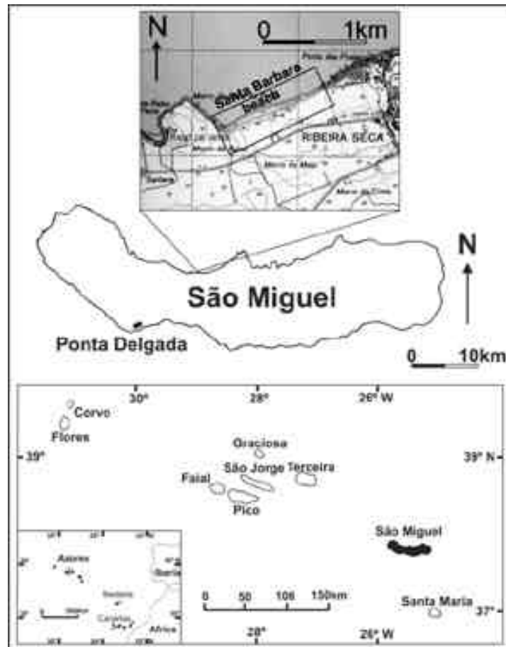
Figure 1. Location of the Azores archipelago and of the study area.

legal constraints to this type of mining activity as well as the inexistence of proper coastal management plans. This ultimately triggered uncontrolled erosion of these coastal features. This situation was only halted in the middle 1990's, yet by that time most of the mining sites had already been damaged or destroyed, with the nearby coast showing clear symptoms of sediment starvation.